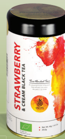
Strawberry Cream: OT/10