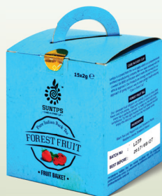
Forest Fruit: FB/01 15 crystal bags