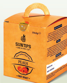
Peach: FB/03 15 crystal bags