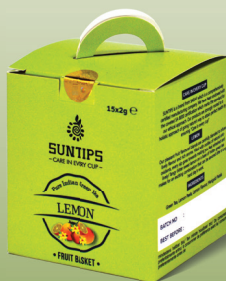
Lemon: FB/06 15 crystal bags