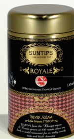
Gold Assam: BD40/05