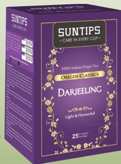
Darjeeling Black tea: BT/03