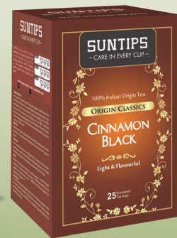
Black tea cinnamon: BT/06