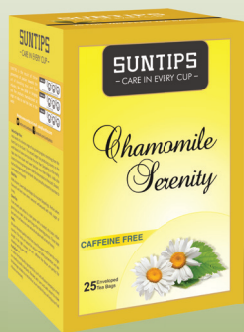
Chamomile Serenity: FH/01