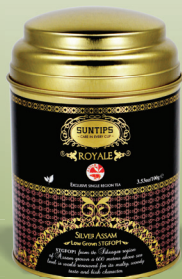
Silver Assam: LT100/06