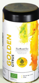
Golden Citrus: OT/03