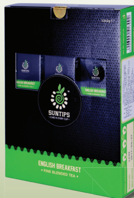
English Breakfast: MB/03