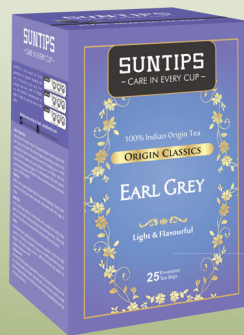
Black tea Earl Grey: BT/05