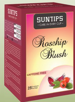
Rosehip Blush: FH/04