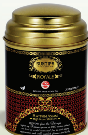
Platinum Assam: LT100/04