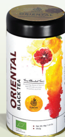
Oriental Black tea: OT/04