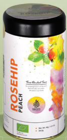
Rosehip Peach: OT/06