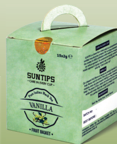
Vanilla: FB/07 15 crystal bags