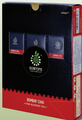
Bombay Chai: MB/02