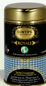
Gold Darjeeling: BD40/02