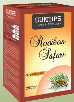
Rooibos Safari: FH/03