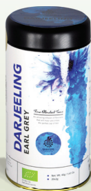
Darjeeling Earl Grey: OT/02