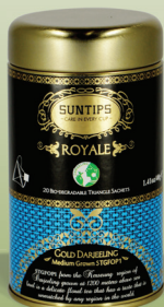
Silver Darjeeling: BD40/03