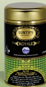
Silver Nilgiri Earl Grey: BD40/07