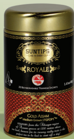
Silver Assam: BD40/06