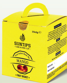
Mango: FB/02 15 crystal bags