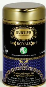
Platinum Darjeeling: BD40/01