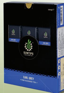
Earl Grey: MB/01