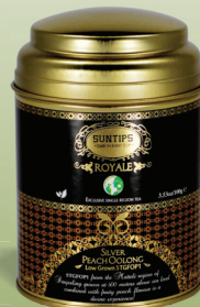
Silver Oolong Peach: LT100/08