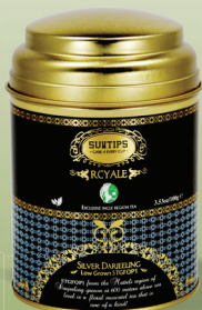
Silver Darjeeling: LT100/03