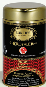
Platinum Assam: BD40/04