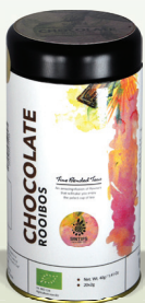
Chocolate Rooibos: OT/01