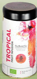
Tropical Fruit: OT/07