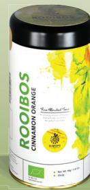
Rooibos cinnamon orange: OT/09