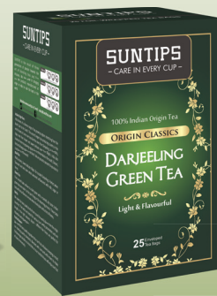
Darjeeling Green tea: GT/01