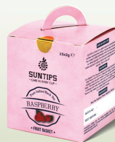
Raspberry: FB/04 15 crystal bags