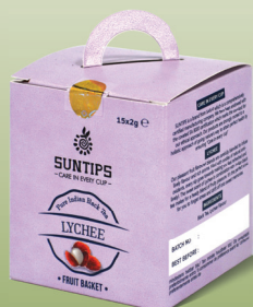
Lychee: FB/05 15 crystal bags