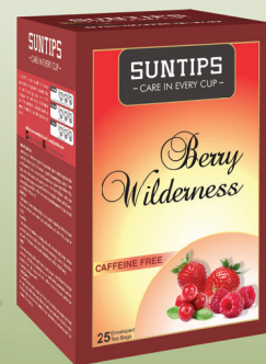
Berry Wilderness: FH/05