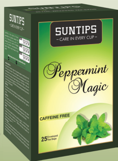
Peppermint magic: FH/02