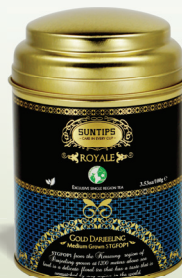
Gold Darjeeling: LT100/02