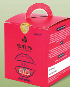
Rose: FB/08 15 crystal bags