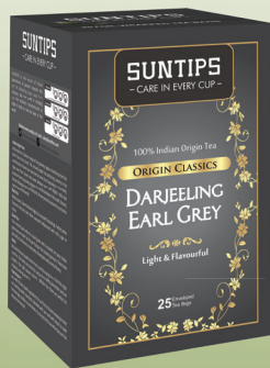
Darjeeling Earl Grey: BT/04