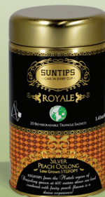
Silver Oolong Peach: BD40/08