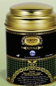
Silver Nilgiri Earl Grey: LT100/07