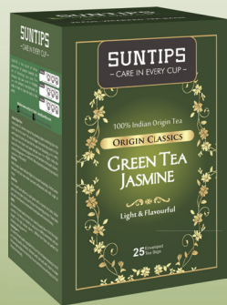
Green tea Jasmine: GT/02