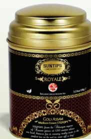
Gold Assam: LT100/05