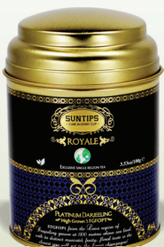
Platinum Darjeeling: LT100/01