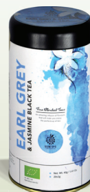
Earl Grey Jasmine: OT/05