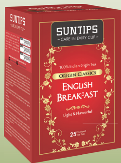
English Breakfast: BT/01